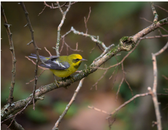
A Lawrence's Warbler was observed in the bird area along Vaughn's Creek. A first ever observation for Warner Parks, this bird is a double hybrid from a Blue-winged Warbler and Golden-winged Warbler.