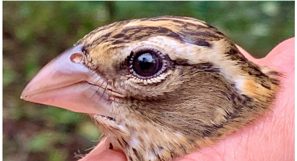
A female Rose-breasted Grosbeak captured at the banding station.