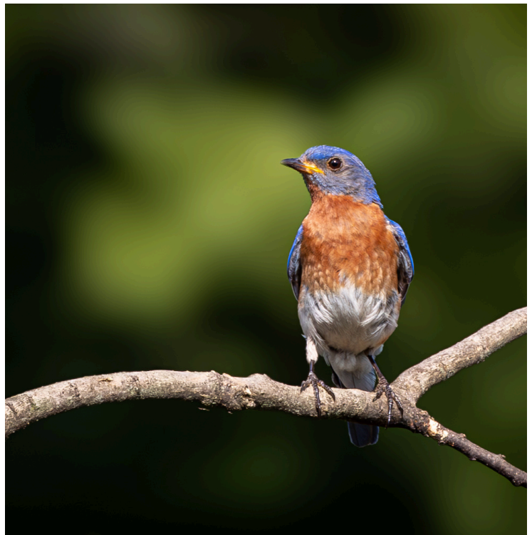
Top left: A Blue-gray Gnatcatcher feeds her young near the banding station, photo by Charlie Curry. Bottom left: Some of the bird banding team. Right: A banded Eastern Bluebird. This male was paired with a banded female bluebird and raising 5 young in a bluebird box in the Ridgefield area of Warner Parks, photo by Terry Cook.