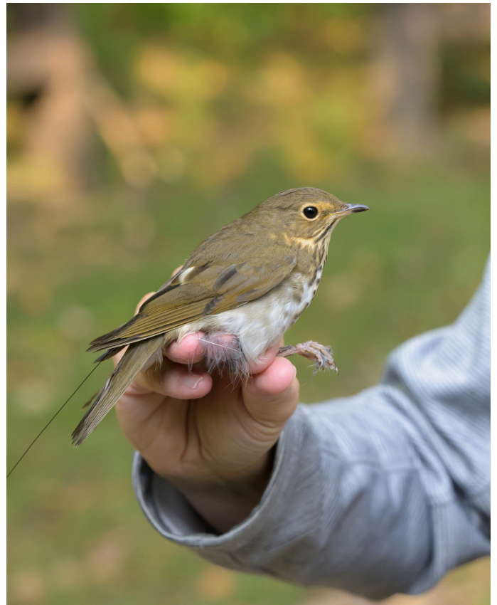
A radio-tagged Swainson's Thrush helps us understand the importance of Warner Parks as a migratory stopover and contributes to our overall understanding of migration.