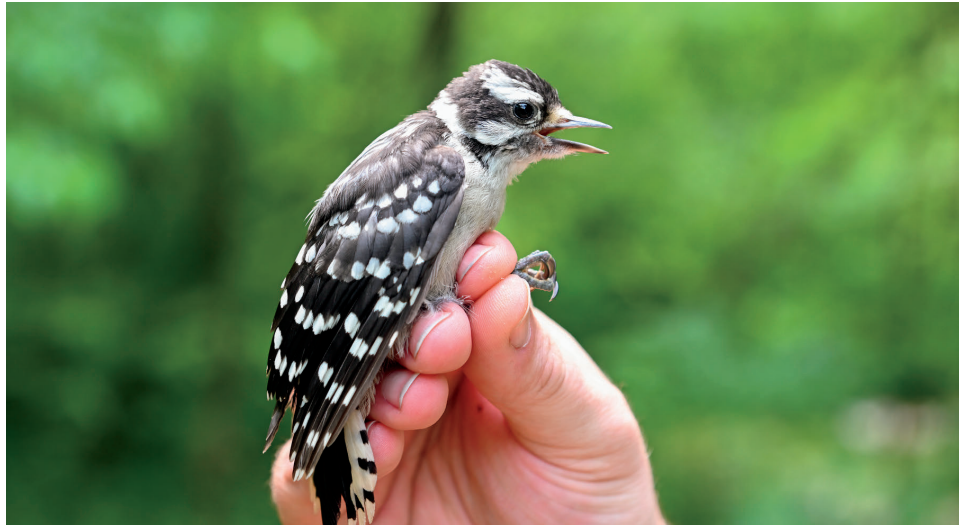
A just-banded Downy Woodpecker, photo by Graham Gerdeman.