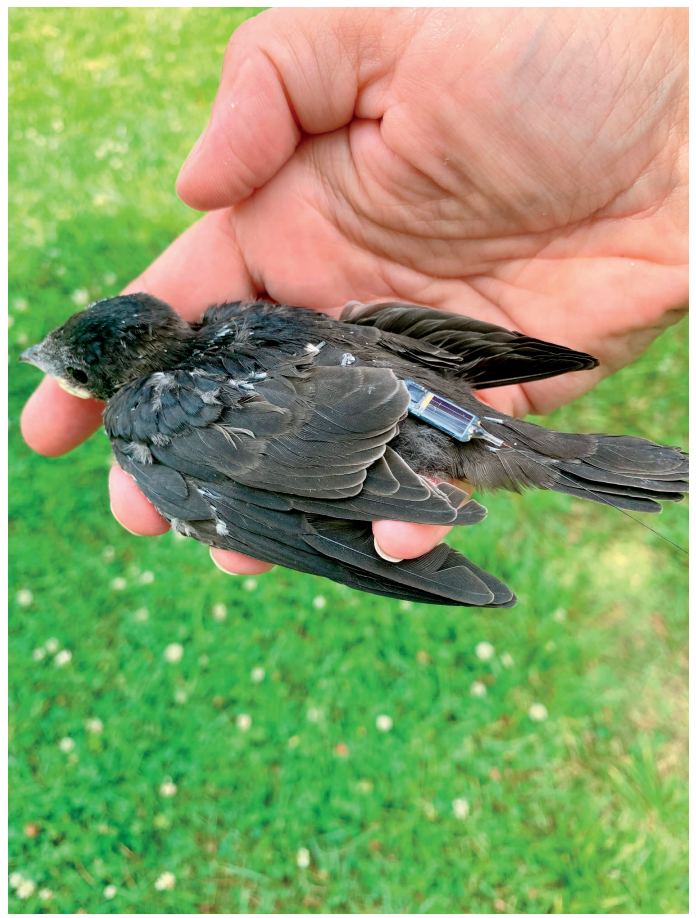
A 20-day-old Purple Martin nestling with a new radio transmitter, photo by Laura Cook.